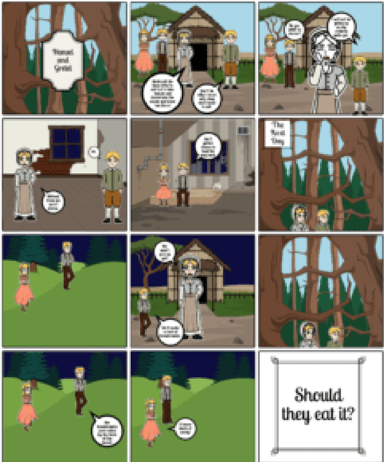
Created with Storyboard That for Storyboard That